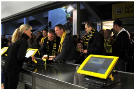
POSLIGNE® customized Odysseé all-in-one terminals in Aachen Tivoli Stadium (Germany)